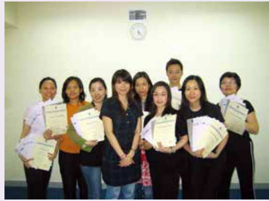
HKMA Hong Kong graduates 2008 2008 年度 HKMA 香港畢業生