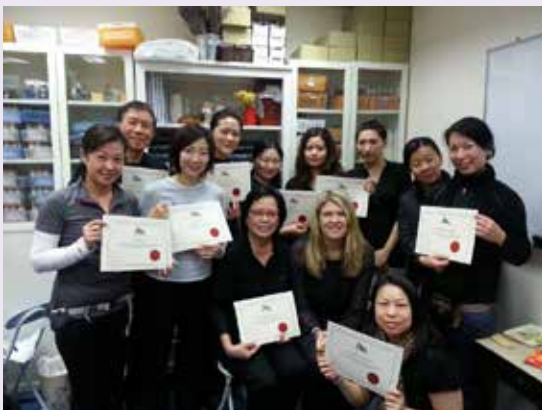
Principal and HKMA Hong Kong students 2013 2013 年度 HKMA 香港畢業生與校長合照 (April Intake)