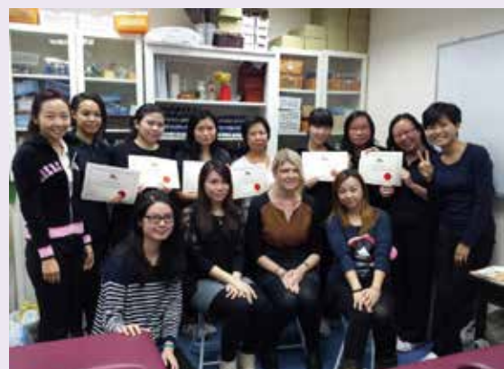
Principal and HKMA Hong Kong students 2013 2013 年度 HKMA 香港畢業生與校長合照 (April Intake)