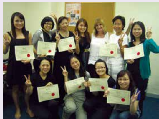
Principal and HKMA Hong Kong students 2009 2009 年度 HKMA 香港畢業生與校長合照 (October Intake)