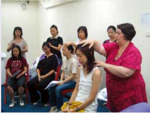
Indian Head Massage (2008 CPD Seminar) 印度頭部按摩 (2008 CPD 講座)