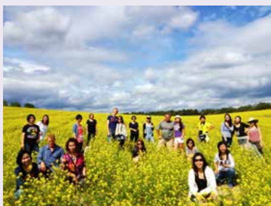
2013 法國普羅旺斯香薰之旅 Provence, France Aromatherapy Tour