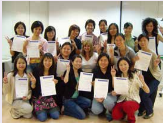
Fleur Graduates Hong Kong Fleur 香港畢業生