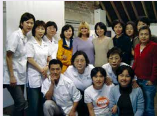
Field trip to England visiting the Lavender farm 學員參加英國薰衣草農場的實地考察