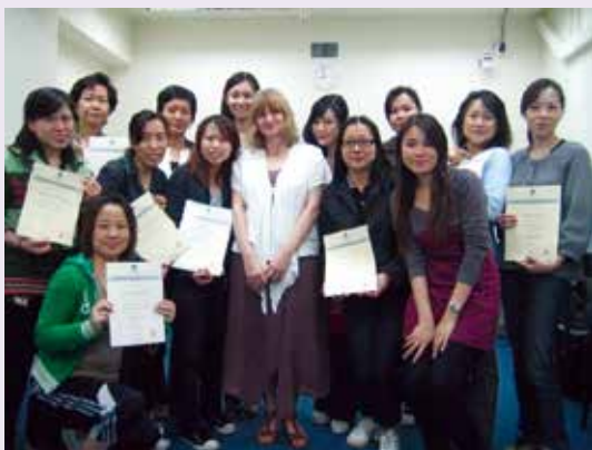
Principal and HKMA Hong Kong students 2009 2009 年度 HKMA 香港畢業生與校長合照 (April Intake)