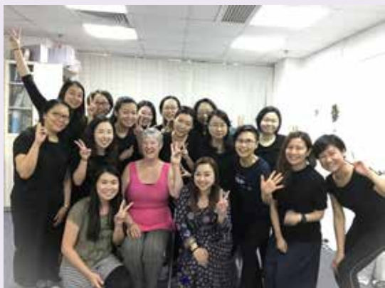
Principal and HKMA Hong Kong students 2016 2016 年度 HKMA 香港畢業生與校長合照 (November Intake)