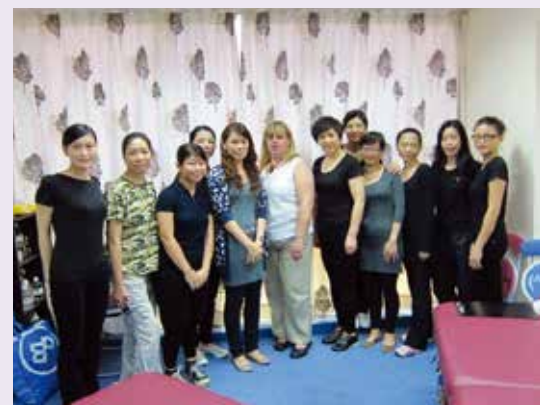
IFPA Examiner and HKMA Hong Kong students 2011 2011 年度 HKMA 香港學生與 IFPA 主考官合照 (Oct Intake)