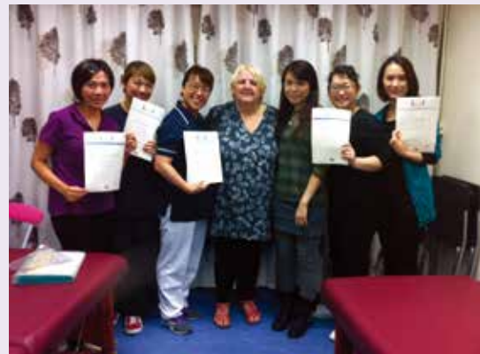
IFPA External Examiner and Hong Kong students 2012 2012 年度香港學生與 IFPA 主考官合照 (Apr Intake)