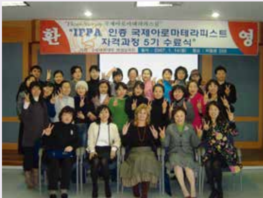
Principal and Korean students 2007 校長與 2007 年度韓國學員留影