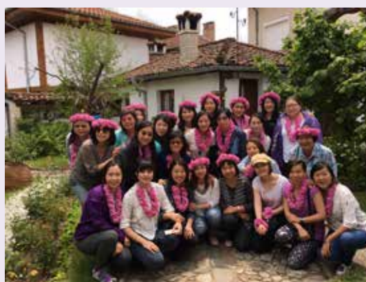
2016 保加利亞玫瑰之旅 Bulgarian Rose Tour