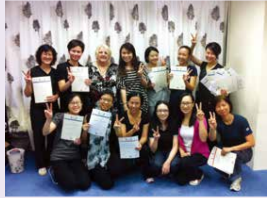
IFPA External Examiner and Hong Kong students 2012 2012 年度香港學生與 IFPA 主考官合照 (Apr Intake)