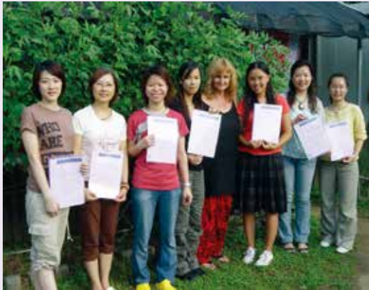
HKMA Hong Kong first graduates 2006 2006 年度 HKMA 第一屆畢業生

Fleur 國際專業香薰治療學院是 IFPA 認可的院校之一，是一間在英國擁有 25 年經驗的專業香薰學院，在香港辦學亦超過十二年。Fleur 的院校遍佈香港、台灣及韓國等地，而且將會在墨西哥、日本和上海等地開設新的院校。至目前為止，從 Fleur 畢業後成為 IFPA 會員的人數超過 1000 人。如欲了解更多關於 FLEUR 的資料，歡迎到以下網頁瀏覽 http://www.fleuraroma.com.hk