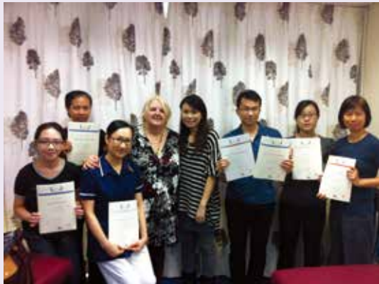
IFPA External Examiner and Hong Kong students 2012 2012 年度香港學生與 IFPA 主考官合照 (Apr Intake)